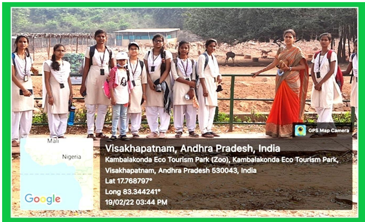
Students at the enclosure of Sambar deer.

Students observed some endemic primates like Bonnet monkey, Rhesus monkey and exotic primates like Baboon, Lemur, etc. Students watched Wild boar, Spotted deer, Nilgai, Sambar deer, Elephant etc.